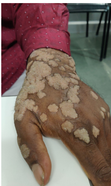
Fig. 1: Benign Verrucous lesions all over the skin

marked surface keratinization- church-spire keratosis. The subepithelial tissue was hyperemic and is infiltrated with few mononuclear inflammatory cells, and kiliocytes were present. The complete blood counts were normal. ELISA for HIV, VDRL/RPR, HBsAg was non-reactive. Hence the clinical diagnosis of OSSN was made. Since the OSSN involves more than six clock hours, an incisional biopsy was done. The biopsy report showed squamous cell carcinoma. To avoid surgical complications such as LSCD, conjunctival scarring, and symblepharon, Mitomycin-C (MMC) 0.04% was started, one drop four times daily for a week and one week off cycle. After three cycles of chemotherapy, the lesion completely regressed (Figure 2b and c). The sequence was continued for one more week with MMC 0.02% to prevent the recurrence. The patient is on regular follow-up for the past one year, and no recurrence was noted (Figure 2d).