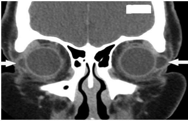
Fig. 4: CT image showing bilateral dacryops

growing lesions, can result in proptosis or globe displacement due to mass effect. 7