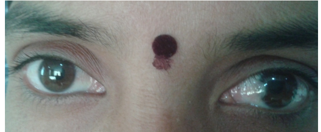
Fig. 1: Female PTR Preop

with an average age 45.3. In our study male:female ratio is 1:1, i.e. 20 Male & 20 Female. All pterygium was Nasal in location. In 40 patients, 23 Right eyes and 17 Left eyes operated upon. All patients had been operated for cosmesis and various symptoms like redness, burning sensation, pain, headache etc.