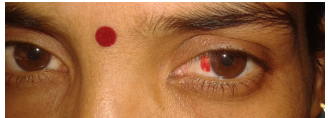
Fig. 2: Graft hemorrhage on 1 week follow-up