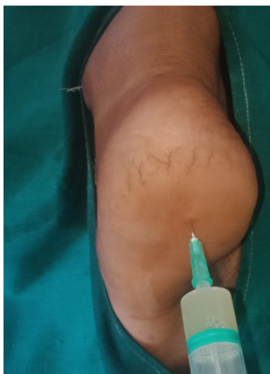
Fig. 1: Showing autologous PRP injection technique for recalcitrant left plantar fasciitis