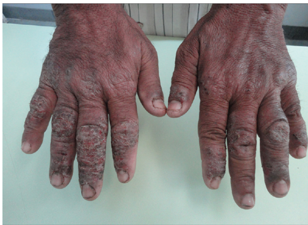
Fig. 4: Showing contact dermatitis in cement worker