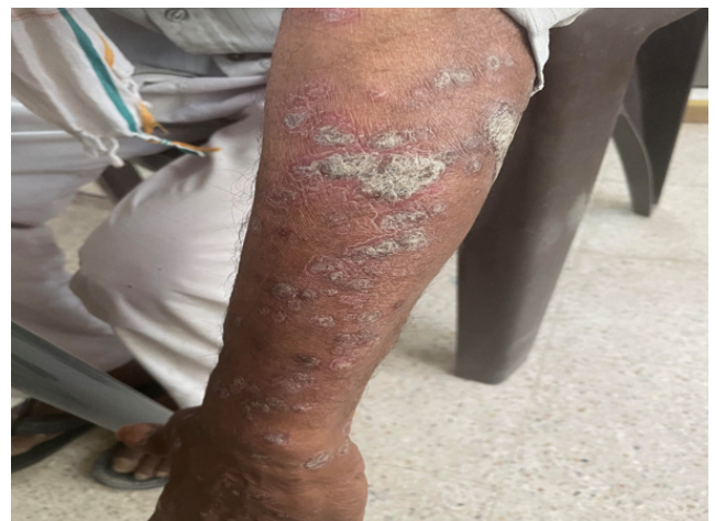
Fig. 3: Showing Psoriatic plaque

Among miscellaneous conditions urticaria were seen in 9 cases (3%). In autoimmune connective tissue disorders DLE seen in 3 cases (1%). In pigmentary disorders 2 cases (0.67%) of vitiligo was observed. Among benign tumour 28 cases (9.33%) of seborrheic keratosis were seen. No case of malignant disorder were found in our study.