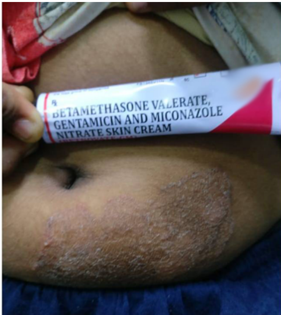
Fig. 1: Tinea Corporis