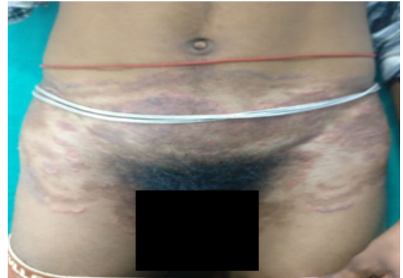
Fig. 3: Tinea corporis et cruris