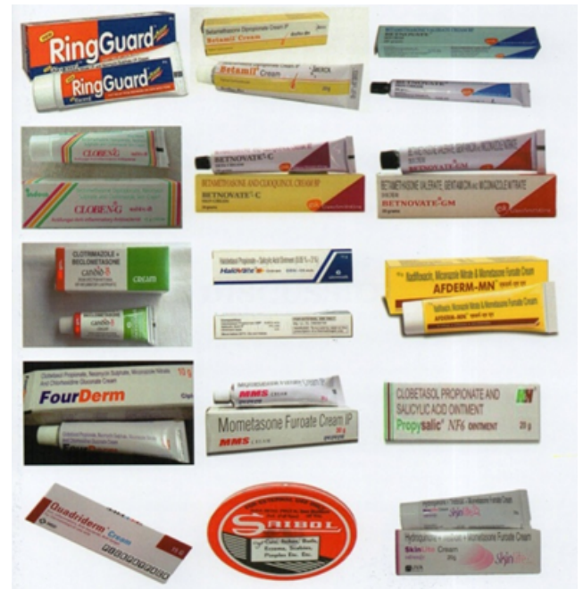
Fig. 5: List of Irrational combination of topical corticosteroid containing preparations

Table 8 Shows that clobetasol propionate 0.05% was the most commonly abused steroid in 25 patients(45.45%) which was used for 0-1 month in 13 patients(48.1%) on an twice daily basis in 7 patients(63.63%) causes most common side effect of Tinea Incognita in 12 patients(36.36%), followed by Betamethasone valerate 0.1% in 17 patients(30.9%) which was used for 0-1 month in 7 patients(36.8%) on an intermittent basis in 7 patients(36.8%) causes most common side effect of Tinea Incognita in 14 patients(25.45%).