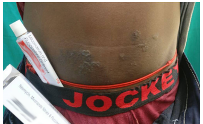
Fig. 4: Tinea corporis