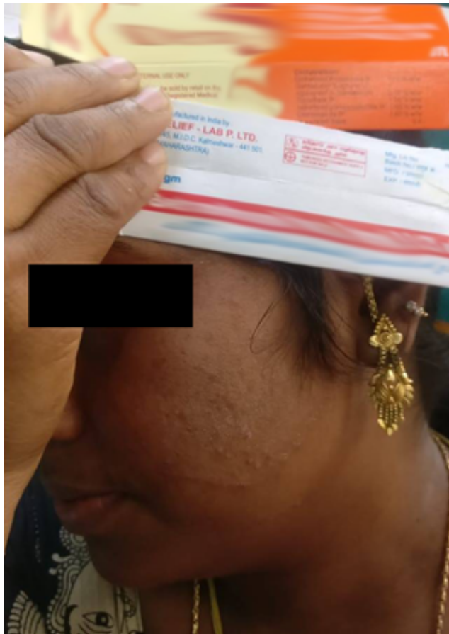
Fig. 2: Tinea faciei