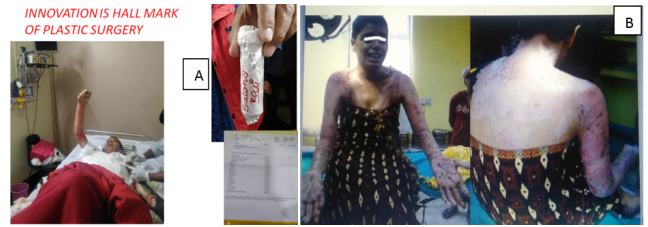
Fig. 9: Bacteriophage Pt. number 2- A on bacteriophage treatment; B Healed burn wound.