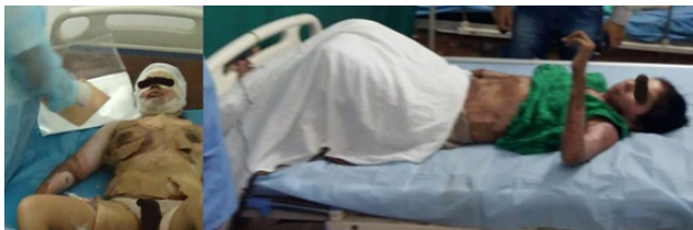
Fig. 7: Collagen Pt. number 4- burn with HIV