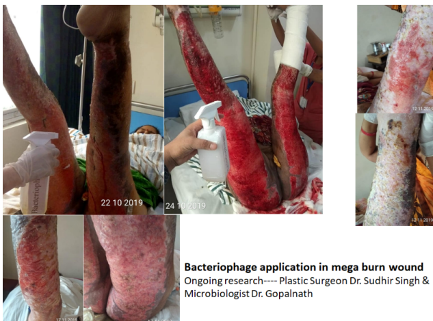
Fig. 8: Bacteriophage treated Pt. number 1