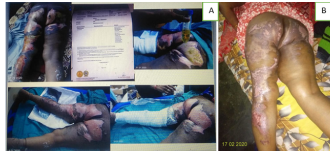
Fig. 10: Bacteriophage Pt. number 3- A on bacteriophage treatment; B Healed burn wound.

to antibiotics. Biofilms contribute to chronic infection. They are made of gelatinous proteinaceous material in which bacteria are entangled and protected from being penetrated by antibiotics. So they are difficult to eradicate with topical and systemic antibiotics. 1-3