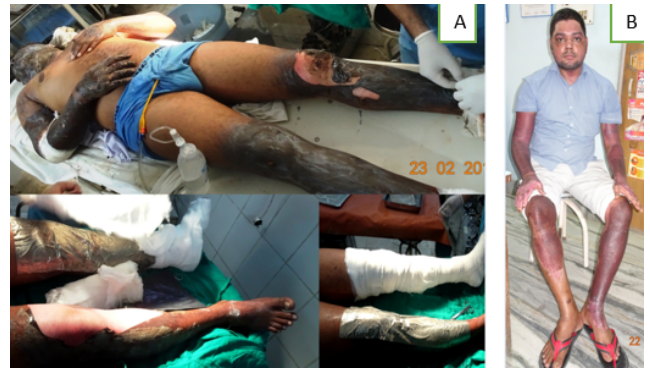
Fig. 2: Nanocryst. silver Pt number 2- A extensive burn, B Healed burn wound.