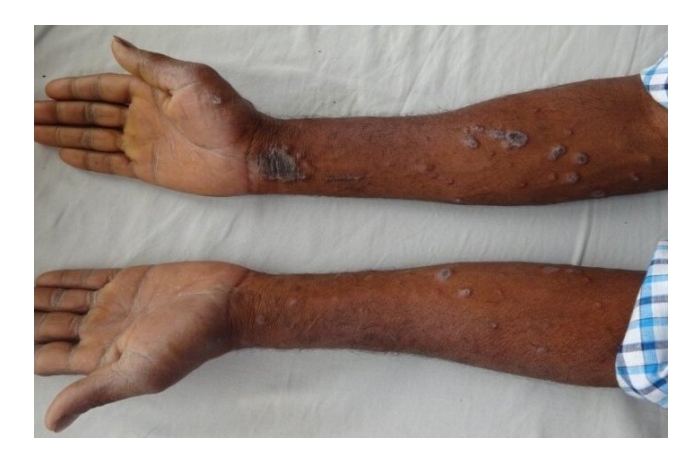
Fig. 3: Showing hypertrophic lichen planus over flexors of both forearm