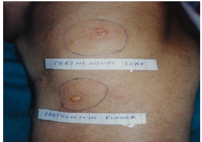
Fig. 2: Parthenium Leaf and Flower