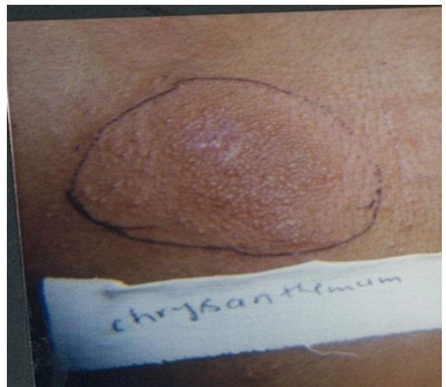
Fig. 3: Chrysanthemum