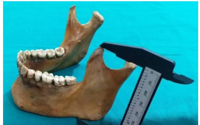
Fig. 1: Showing measurement procedure for coronoid height

The coronoid process can be removed intra-orally without any functional deficiency and facial disfigurement. It is expected that a knowledge of the morphometric profile of the coronoid process in different populations will aid the clinician in reconstruction procedures such as those pertaining to orbit floor, alveolar defects, paranasal sinus augmentation, non union fracture mandible, osseous defects reconstruction and other repair procedures in cranio-maxillo facial surgeries. 17,18