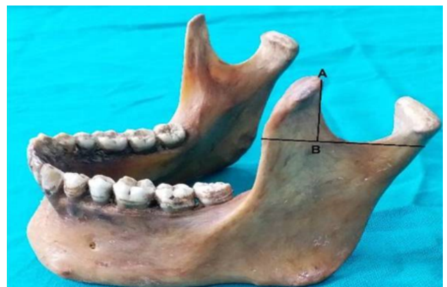
Fig. 2: AB is length of coronoid process