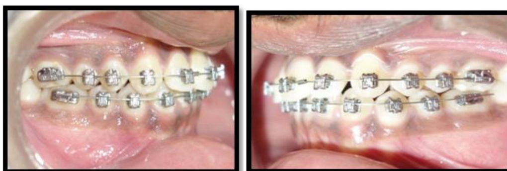
Fig. 3: (a) Showing the placement of molar tube on 1 st molar of upper right quadrant (AO) and lower right quadrant (OO) and (b): Showing the placement of molar tube on 1 st molar of upper left quadrant(OO)lower left quadrant (AO)