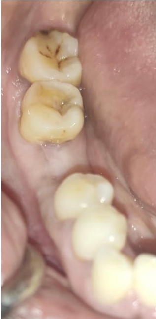
Fig. 1: Pre-operative view in relation to 46

edentulous space in relation to 46 with no mesial drifting of 47 or supra-eruption of 16 (Figure 1). Radiographic examination revealed adequate bone height and bone width. CBCT in relation to 46 was taken and bone mapping was done to assess the accurate bone height and bone width (Figure 2). The treatment plan included phase I therapy followed by implant placement in relation to 46 after 1 week. The treatment plan was explained to the patient and written informed consent was obtained for the same.