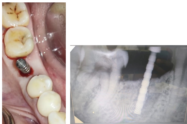
Fig. 5: Parallelism checked in relation to 46 after initial drilling of the osteotomy site