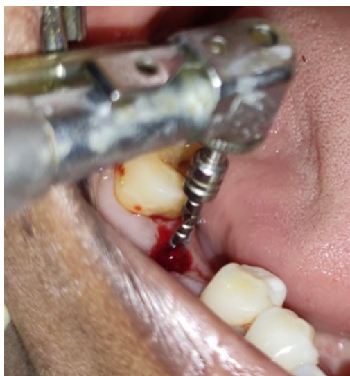
Fig. 4: Osteotomy site prepared in relation to 46