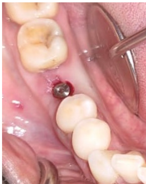
Fig. 6: Implant placed in relation to 46