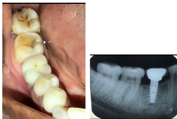
Fig. 8: Final restoration done after 4 months and IOPA taken immediately after restoration of 46

The disadvantage of flapless implant surgery is that it is a “Blind technique” i.e; the surgeon’s inability to visualize anatomic landmarks and vital structures due to lack of flap reflection. This can be resolved with the help of CBCT and