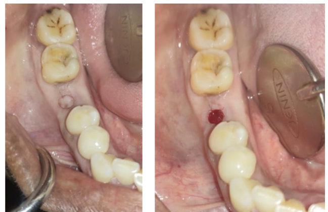
Fig. 3: Soft tissue punched out in relation to 46

Preprocedural mouthrinse of 0.2% chlorohexidine was administered before the start of the procedure. After infiltration of local anaesthesia (2% lidocaine) in relation to 46, a soft tissue punch of diameter 4mm was used to punch out the soft tissue at the surgical site (Figure 3). The osteotomy site was prepared using an initial round bur and a 2mm twist drill with copious amount of saline irrigation and parallelism was checked (Figures 4 and 5). This was followed by subsequent drills of different height and diameters to achieve the desired height and width. Adin implant of size 4.2*10mm was placed in the osteotomy site (Fig 6) and a healing cap was placed on the implant. Immediate post-operative radiographs were taken (Figure 7). Post-operative instructions were given to the patient. Medications included Amoxicillin 500mg thrice daily for 3 days and Zerodol-P twice daily for 3 days. The patient was reviewed at 1 week, 2 weeks, 4 weeks and 4 months. No severe pain or discomfort was reported by the patient. Healing was uneventful. The final prosthesis was given after 4 months (Figure 8).