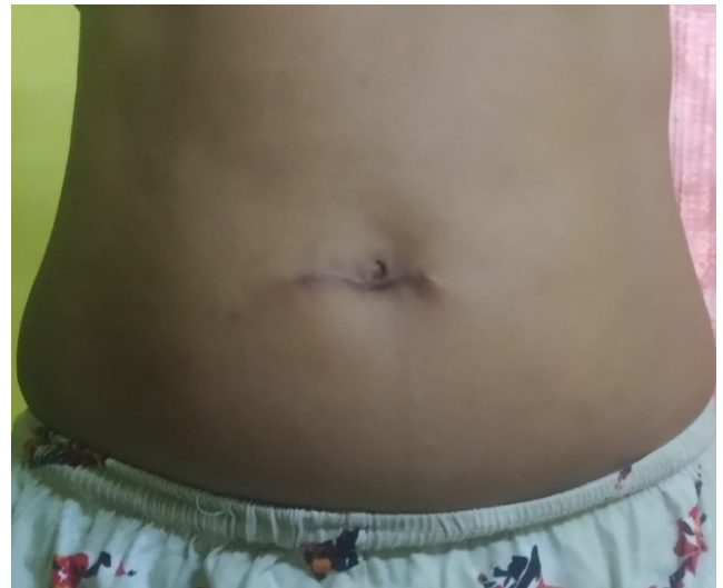
Fig. 2: At 10 months follow up, with well defined umbilicus

The patient was discharged on the following day. At two months she had complete relief from her symptoms. At the time of last follow up, at 10 months post-surgery, there were no signs of any recurrence of the disease. The neoumbilicus had a well-defined shape and position and was aesthetically acceptable to the patient (Figure 2).