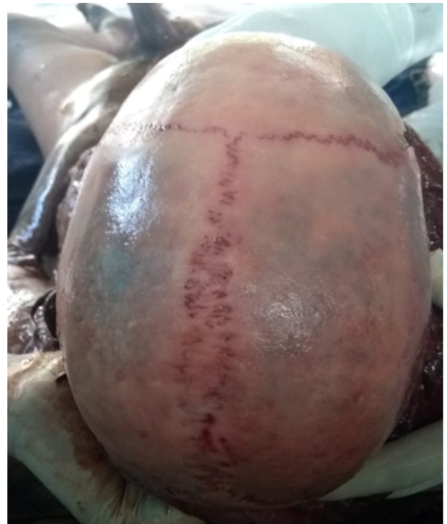
Fig. 2: Wormian bone in sagittal suture

wormian bones according to various studies is depicted in Table 4.