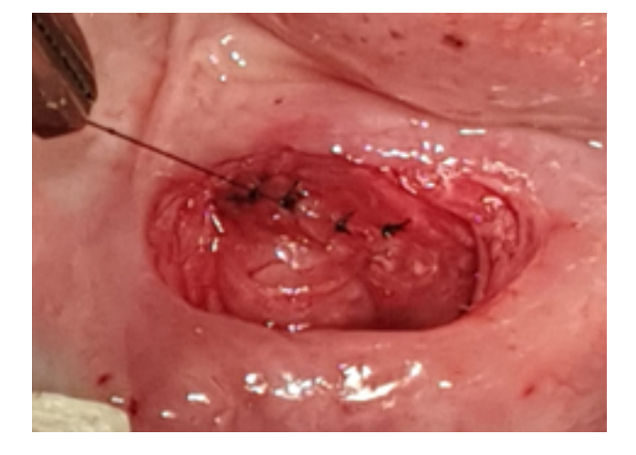
Fig. 5: Intra oral picture after stone removal