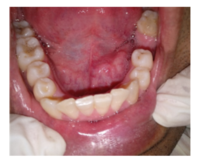
Fig. 1: Intra-oral dome shaped swelling of left submandibular region

On intraoral examination, Single, ovoid, dome-shaped intraoral swelling of size approximately 1 \times 3 cms seen in floor of mouth extending from midline to lingual frenum towards left side along the floor of mouth upto the lingual vestibule (Figure 1). Overlying surface appeared stretched, pale pink & translucent with no pulsations or varicosities. Borders were diffuse which blended along normal adjacent mucosa. Swelling was afebrile, tender and was without any discharge on palpation. It was non-compressible, fluctuant & mobile, not attached to any underlying structures. By bimanual palpation of submandibular salivary gland was tender on palpation. Opening of Wharton's duct was raised and inflamed on palpation.