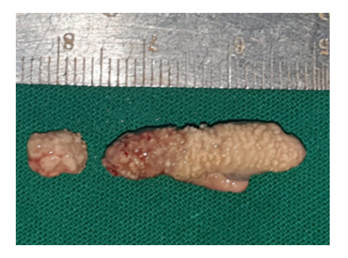
Fig. 6: Giant stone measuring 2.5cms and other one measuring lcms

The disease can occur at any age, but it appears more frequently in the third to sixth decades of life.<sup>1</sup> The majority of the sialoliths are formed from phosphate and oxalate salts. They are also composed of varying ratios of organic and inorganic substances. The organic substances are glycoproteins, mucopolysaccharide's and cellular debris, inorganic substances are mainly calcium carbonate and calcium phosphate.<sup>8</sup>