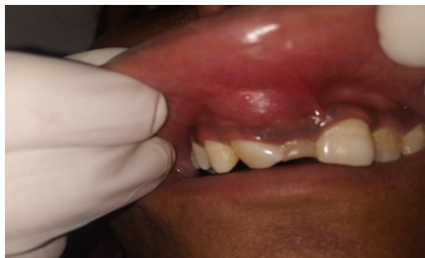
Fig. 1: An intraoral swelling seen in the labial vestibular region extending from the frenum to the mesial aspect of 13

AOT was classified into 1 st group of tumors in the year 2005 by WHO. 4 It is benign, non invasive lesion which three variants namely intraosseous, follicular, peripheral and extrafollicular. 7 Mostly the non neoplastic lesions of the oral cavity is the apical cyst, dentigerous cyst, Calcifying Epithelial Odontogenic cyst, Odontogenic Keratocyst, Central Giant Cell Granuloma whereas the common neoplastic lesions are the AOT, unicystic ameloblastoma, ameloblastic fibroma, ameloblastic fibro-odontoma. 5 A