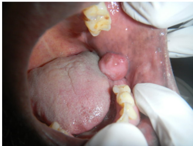
Fig. 1: Clinical picture showing growth (2x2) cm diameter n the left buccal mucosa

Routing H and E staining were done. On histopathological examination of the lesion, it depicted mature adipose tissue admixed with collagen streaks with well-demarcated surrounding connective tissues. The thin fibrous capsule exhibited a lobulated pattern. The section also showed few blood vessels in the connective tissue stroma. [Figure 3] Based on the clinical and histopathological findings a diagnosis of lipoma was given. Post-operative follow up revealed uneventful healing with no recurrence.