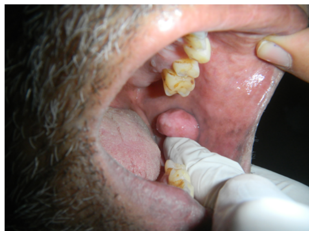
Fig. 2: Clinical picture showing pedunculated base