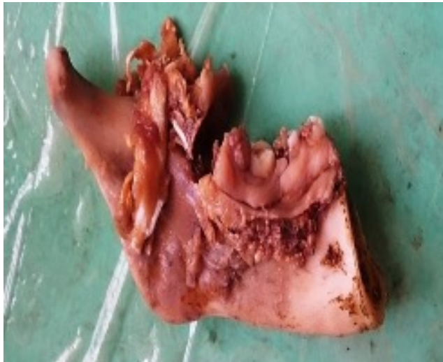
Fig. 1: Gross specimen of left hemomandibulectomy with ill defined tumor mass

The specimen consisted of the left sided mandible with a 3cm x 2cm x 1.5cm in size, ill-defined mass, brown in colour, at the lower one-third of the left side of the face, which extended, supero-inferiorly, three cm from the left zygoma to three cm above the inferior mandibular border and anteroposteriorly, four cm from the angle of the mouth to three cm from the angle of the mandible.(Figure 1)