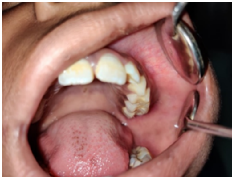
Fig. 2: Intraoral swelling appeared to be arising from buccal vestibule extending up to 1 st molar overlying mucosa appears normal in color and on palpation swelling was firm in consistency and tender on palpation