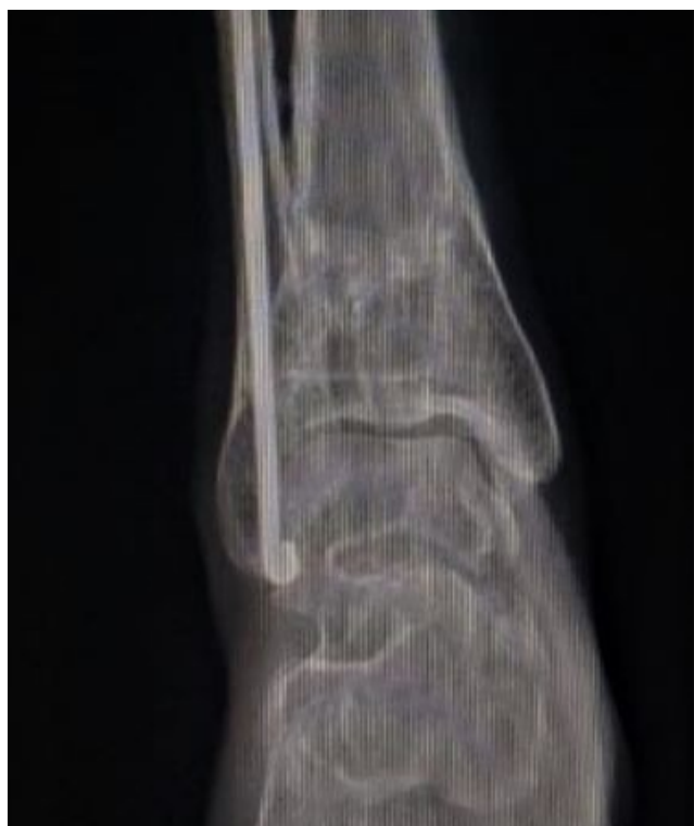
Fig. 3: 12 month postoperative X-ray Antero-posterior view