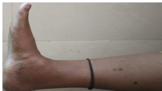
Fig. 5: Dorsiflexion