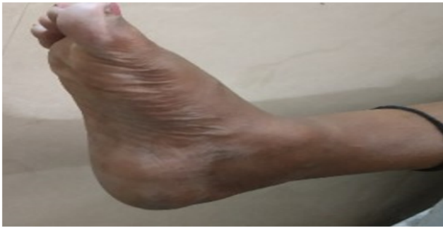
Fig. 7: Eversion