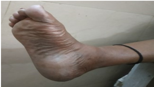
Fig. 8: Inversion

fracture in younger population is due to their more active involvement in outdoor activities making them more prone to road traffic accidents (RTA). The male to female ratio of 2:1 in our study was in correspondence with Gabriele Falzarano et al. 7 who found the ratio to be 3.65:1 and Jing-Wei-Zhang et al. 8 with a ratio of 3:1. Preponderance of male patients is due to males being more indulged in travelling, physical labor, working in fields and factories. In our study the most common mode of injury was RTA (53.33%) while Jing-Wei-Zhang et al. 7 reported 55% of their cases due to RTA.