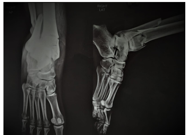
Fig. 1: Preoperative X-ray AP and Lateral View showing distal tibia fracture with fibula fracture

patients had Good or Fair AOFAS score. The mean score was 83.13 with a p-value of 0.036 which was statistically significant. Two patients (6.67%) had pin track infection, 1 patient had nonunion, 1 patient had malunion (3.33%) of the distal tibia requiring secondary procedure. One patient (3.33%) had pain due to ankle arthrosis which was managed conservatively till the last follow up at 12 months.