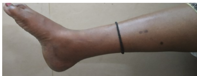
Fig. 6: Plantarflexion