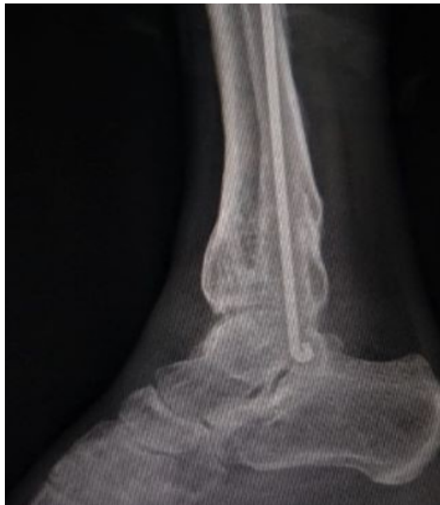
Fig. 4: 12 month postoperative X-ray lateral view