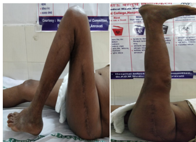
Fig. 4: Case 4- DCS

The current study showed a male preponderance as more number of male patients were affected by subtrochanteric femur fractures than female patients. Similarly, according to the study of Wei et al., (2014), 10 the number of male patients was more as compared to that of the female. Furthermore, as per the study of Sanju et al., (2017), 11 the number of male patients affected by subtrochanteric femur fractures