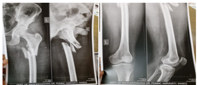
Fig. 2: Case 2- PFN