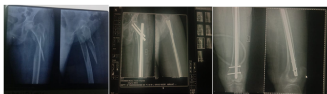
Fig. 1: Case 1-PFN