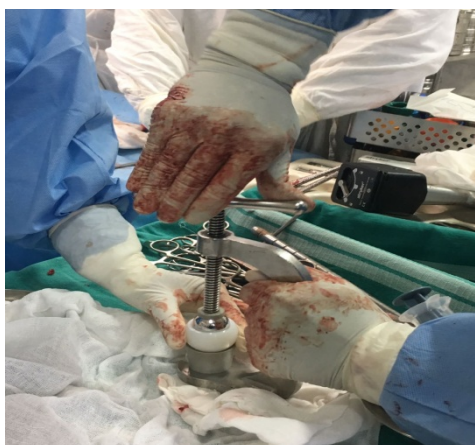
Fig. 1: Assembly of femoral head