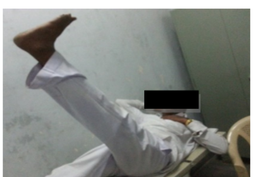
Fig. 8: Case 2: Follow up at 1 year