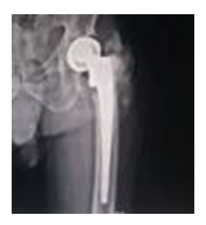
Fig. 7: 1 year