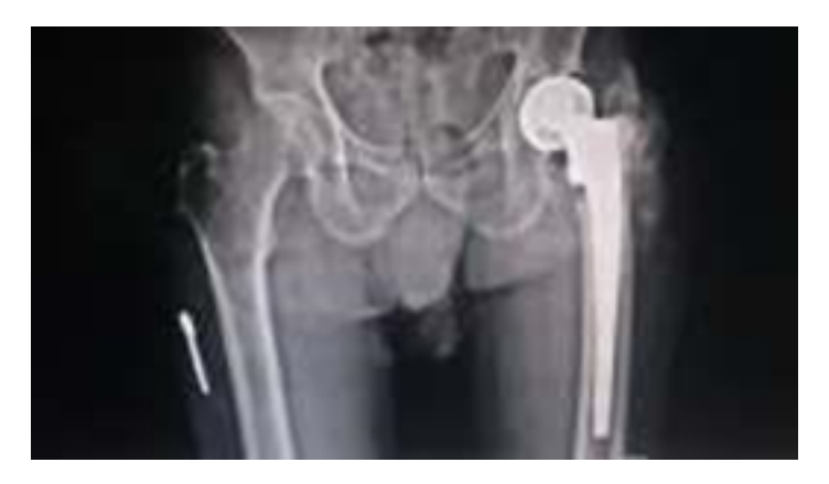
Fig. 6: Immediate post op