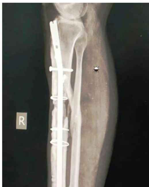
Fig. 9: Tibial interlocking nail in situ