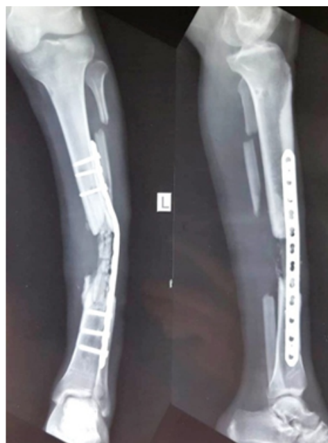
Fig. 1: Infected Non-union with implant failure

Out of 20 patient, 1 patient developed severe equinus deformity at ankle joint and 1 patient had limb length discrepancy >3.5 cm. Six patient had superficial pin tract infection.