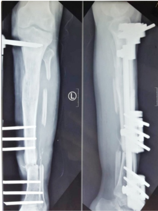
Fig. 4: Regenerate consolidation with bone endsunion