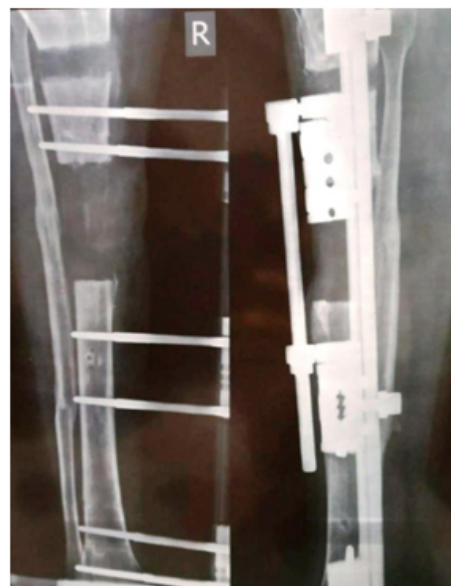
Fig. 10: Corticotomy with bone transport