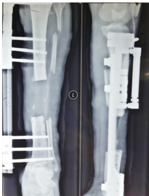
Fig. 2: Resected infected bone segment with corticotomy