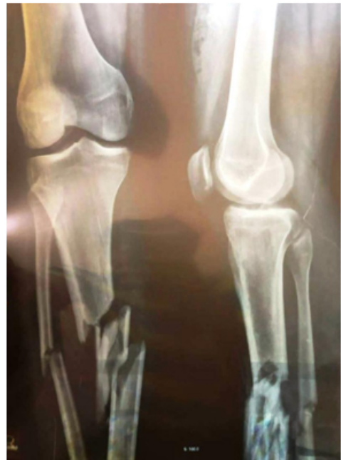
Fig. 6: Comminuted tibial shaft fracture