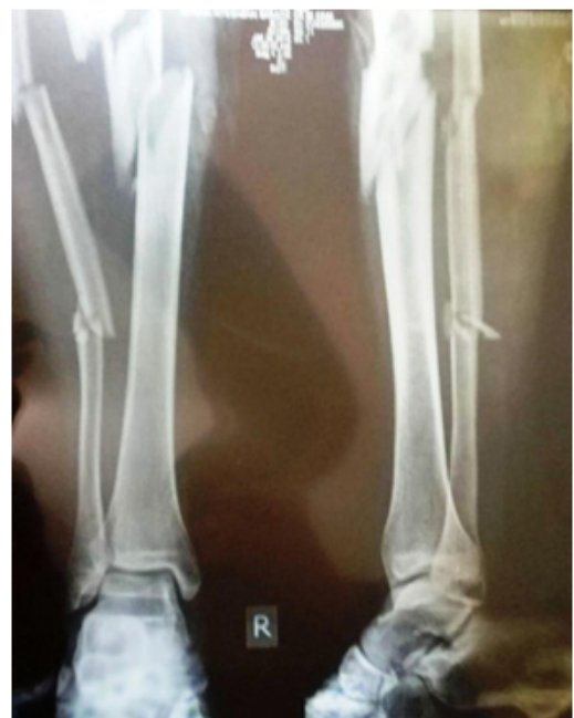
Fig. 7: Comminuted tibial shaft fracture