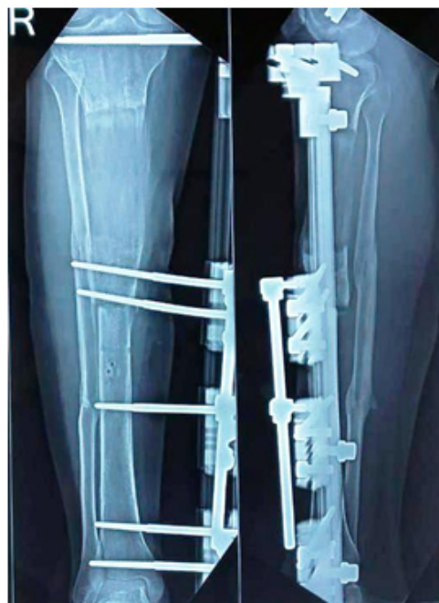
Fig. 11: Bone transport with regenerate replacing resected bone length

he discontinued bone transport because of severe pain. One case developed loosening of the pin in which we had to re adjust the frame and change the pin. LRS is easy to handle and apply in comparison to ilizarov fixator, though that is also equally good to achieve union in infected non-union cases but LRS is compatible, light weighted simple design and short learning curve to apply. Wound care is easy and permits early mobilisation and rehabilitation. It provides more stability because of the tapered pins. Axial