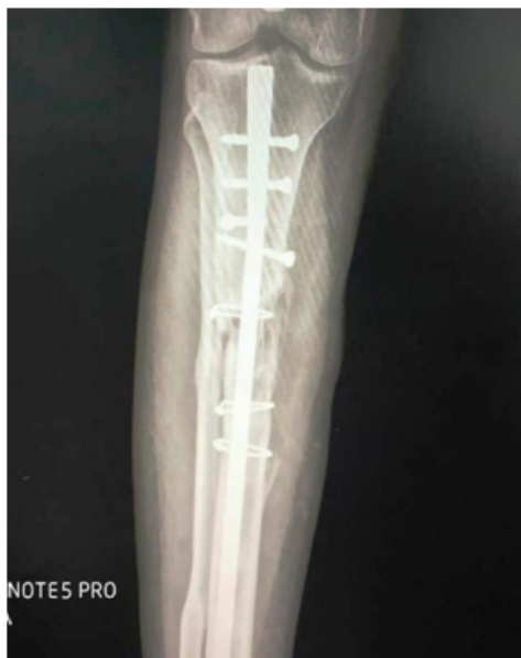
Fig. 8: Tibial interlocking nail in situ