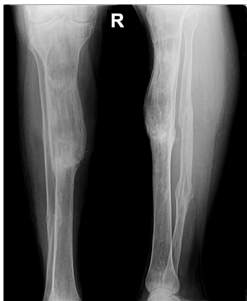
Fig. 12: Removal of LRS and regenerate consolidation with bone ends union

compression can be achieved at the fracture site by using the compression-distraction device.