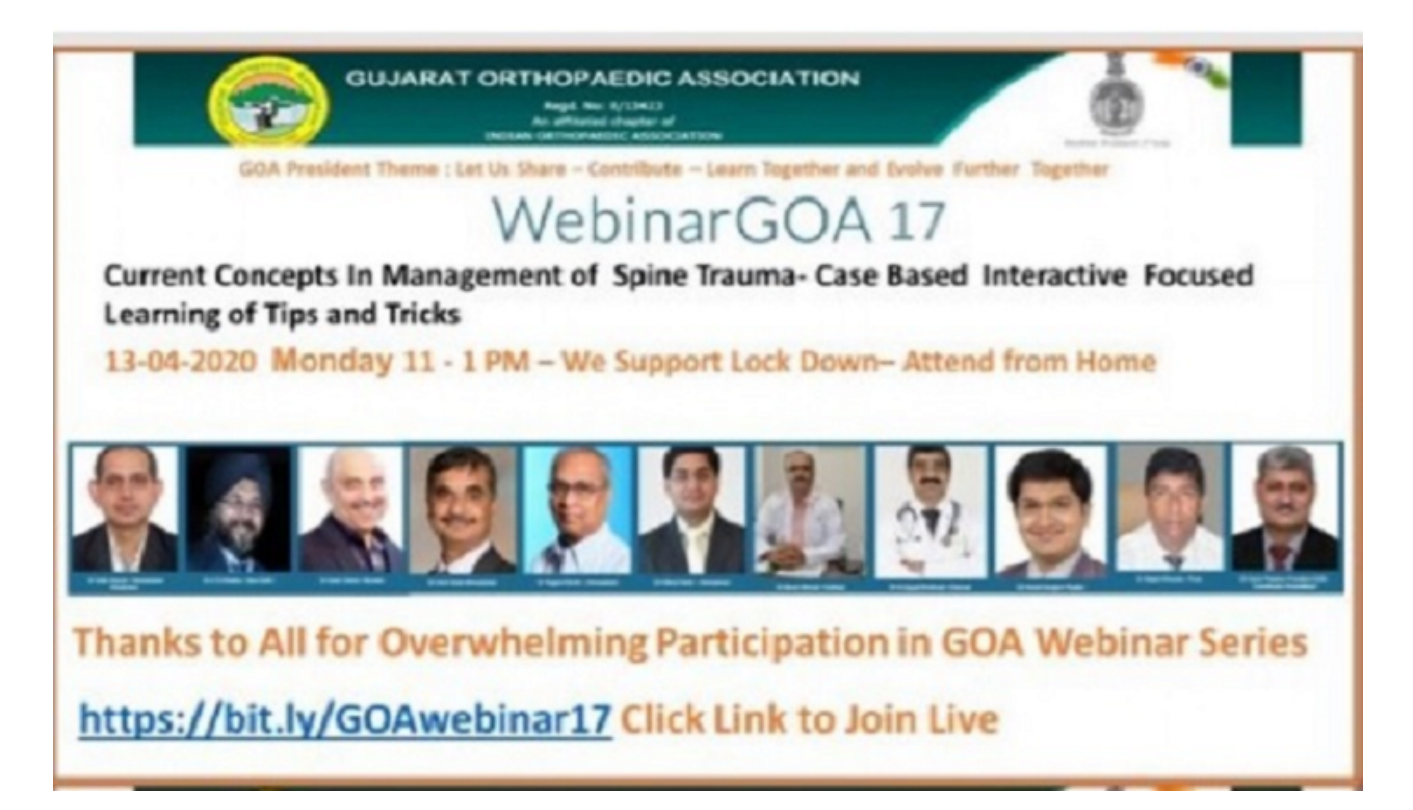
Fig. 1: Information brochure about Gujarat orthopaedic association webinar