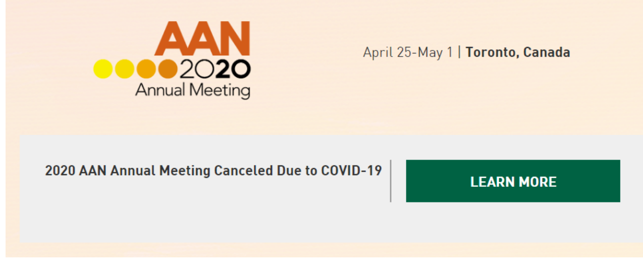
Fig. 4: American association of neurology conference cancelled due to Covid-19

Fig. 3: Facts about Covid- 19 webinar being conducted by PCMA accredited by American society for microbiology.