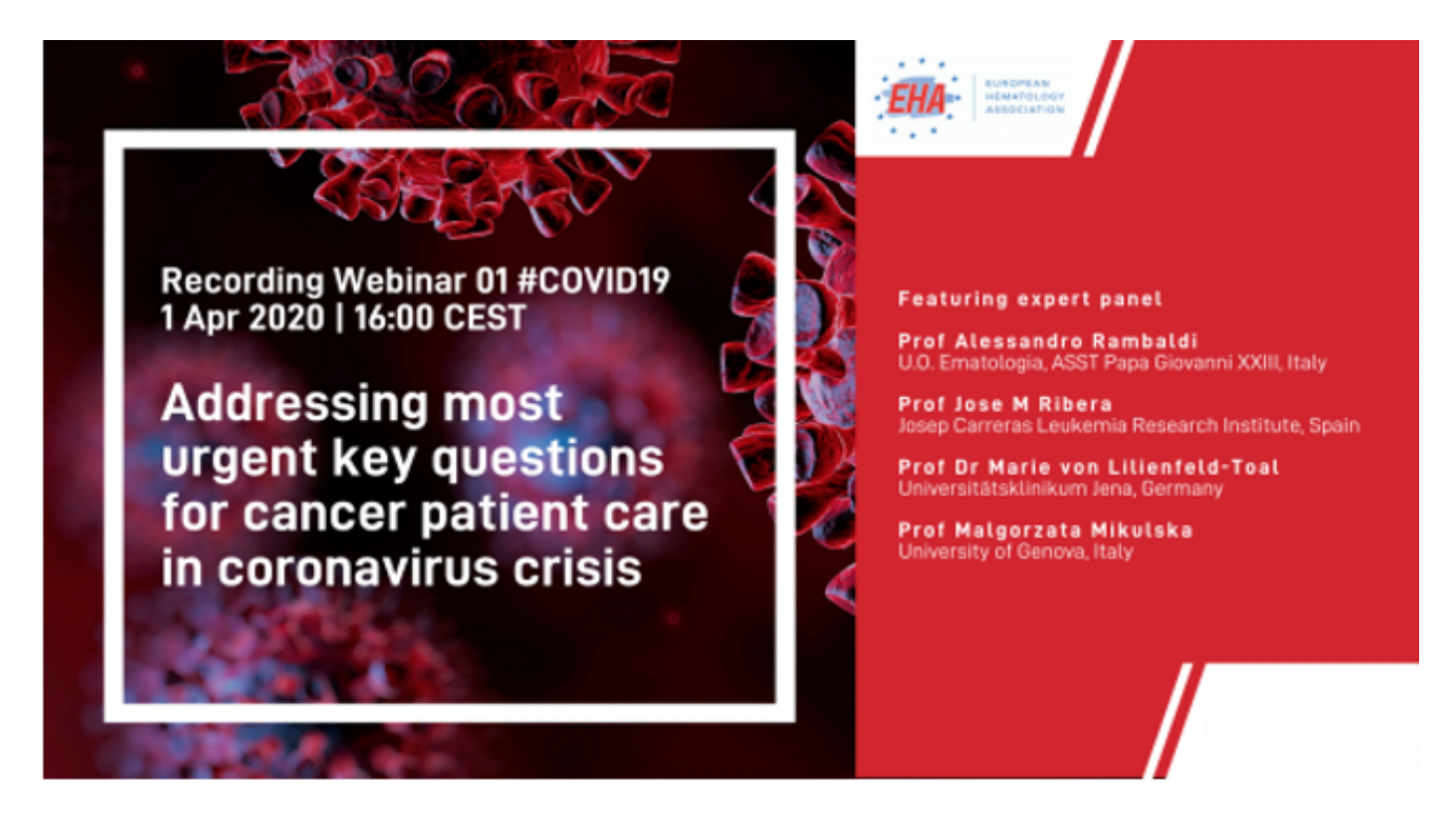
Fig. 2: Information brochure about webinar about Covid- 19 updates

Fig. 1: Information brochure about Gujarat orthopaedic association webinar