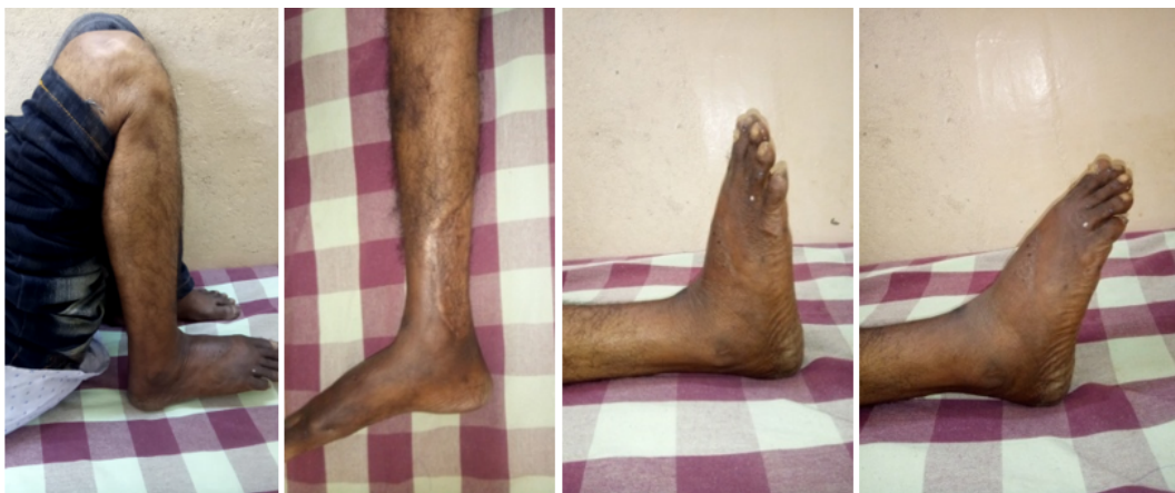
Fig. 6: Shows ROM (AO Group)