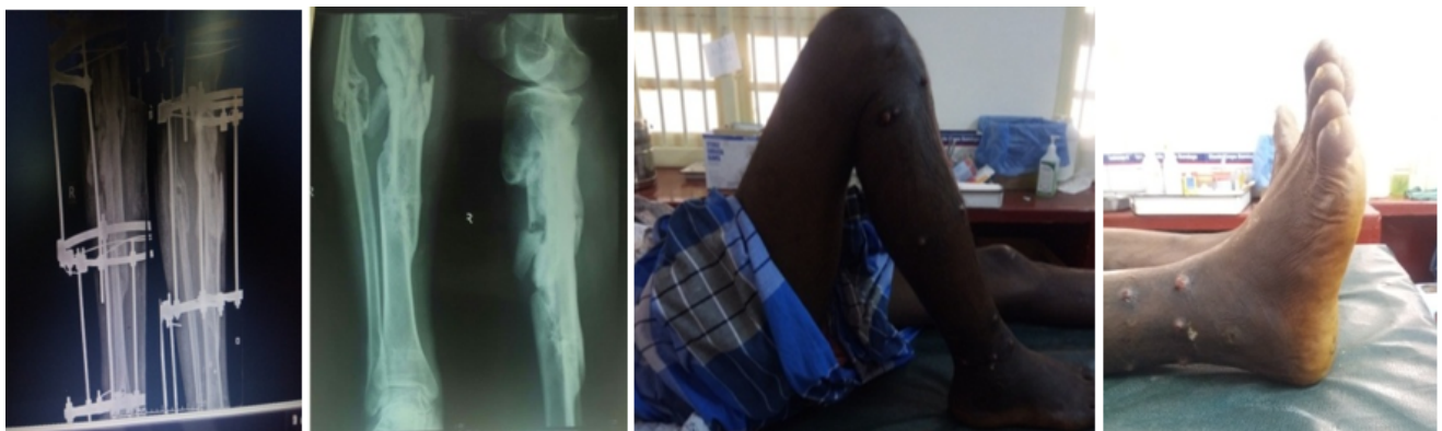
Fig. 3: Shows follow up x-ray ROM at 32 weeks(Ilizarov Group)