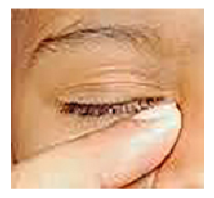
Fig. 3: Large finger-tip of an adult cannot compress a deeply situated lacrimal sac in the lacrimal fossa