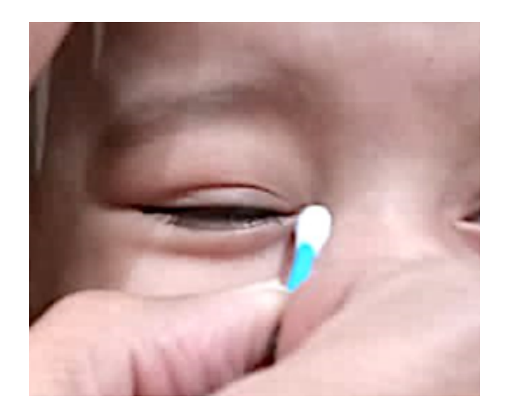
Fig. 4: Right Sac compression by cotton-tip in an infant

visit. FDDT was positive in all these cases. Therefore, in our study too, it accurately predicted the cases in which the blockade had not fully resolved and helped parents understand the need to continue with the sac compression and cleaning therapy.