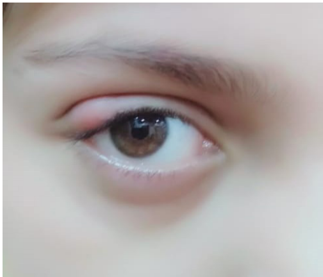
Fig. 1: Chalazion with Inflammation