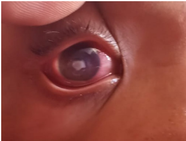
Fig. 4: Hypopyon corneal ulcer

suspected viral or allergic origin. Holland APA et al. 9 also find that combination of antibiotics with steroids for short term (< 2 weeks) in viral conjunctivitis could be effective and well tolerated. 8 Azari AA et al. has shown in their meta-analysis that among infectious conjunctivitis, nonherpetic viral conjunctivitis is the most common cause followed by bacterial conjunctivitis. 10 We have avoided steroids in conjunctivitis with muco-purulent discharge. There is a well elaborated article by Shetty R et al., 11 about understanding and management approach of conjunctivitis by an ophthalmologist, following CODE protocol in in-patient consultation. They also emphasized to make balance between minimizing potential risk of transmission and timely management of Conjunctivitis patient. They also pointed out in CODE protocol that all patients of conjunctivitis don't need slit lamp evaluation and epidemic conjunctivitis patient can be disposed off after torch light examination.