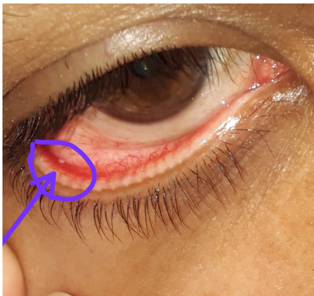
Fig. 2: Concretion