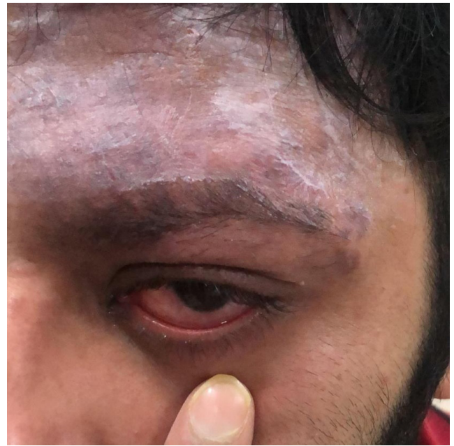
Fig. 5: HZO conjunctivitis

suspected viral or allergic origin. Holland APA et al. 9 also find that combination of antibiotics with steroids for short term (< 2 weeks) in viral conjunctivitis could be effective and well tolerated. 8 Azari AA et al. has shown in their meta-analysis that among infectious conjunctivitis, nonherpetic viral conjunctivitis is the most common cause followed by bacterial conjunctivitis. 10 We have avoided steroids in conjunctivitis with muco-purulent discharge. There is a well elaborated article by Shetty R et al., 11 about understanding and management approach of conjunctivitis by an ophthalmologist, following CODE protocol in in-patient consultation. They also emphasized to make balance between minimizing potential risk of transmission and timely management of Conjunctivitis patient. They also pointed out in CODE protocol that all patients of conjunctivitis don't need slit lamp evaluation and epidemic conjunctivitis patient can be disposed off after torch light examination.