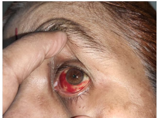
Fig. 6: Subconjunctival haemorrhage

AAO (American Academy of Ophthalmology) has put forth important references in relation to conjunctivitis where SARS-CoV-2 RNA was isolated from ocular secretions of COVID-19 positive patients which further warn the possibility of disease transmission. 12 WHO (World Health Organization) has also notified occupational hazards to health worker due to pathogen exposure, long working hours, psychological distress etc. 13 In this regard we think that teleophthalmology has played a significant role in transmission of COVID-19.