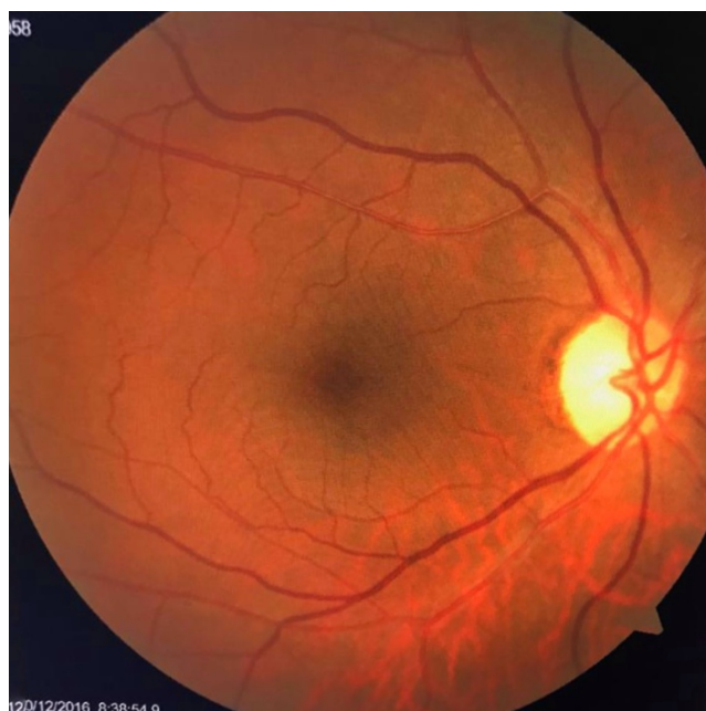
Fig. 1: Glaucomatous optic atrophy

Decreased IOP was highest among patients taking CCB in 25 patients (50%), followed by beta blockers in 14 patients (44.4%), ACE inhibitors, ARB and diuretics in 1 patient. The range of IOP in the treated population was between 10-16mmHg and this difference in those on hypertension medications was statistically significant with p value = 0. 03.