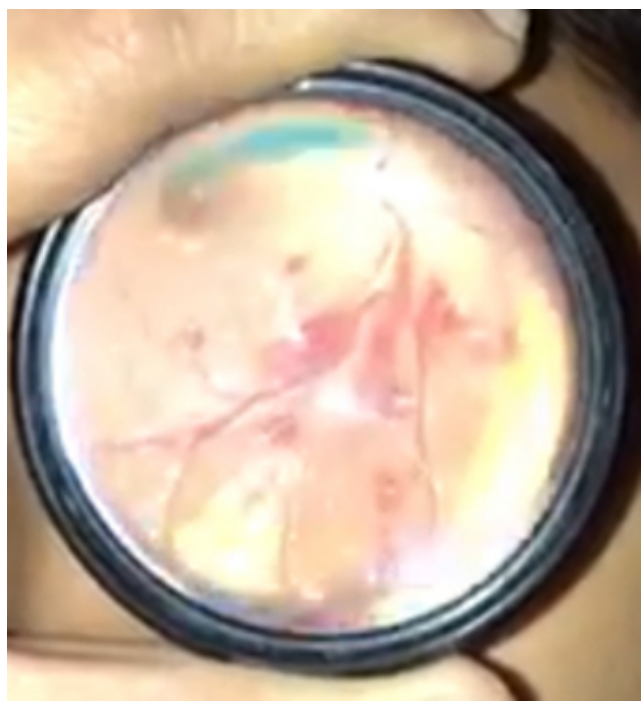
Fig. 2: Left eye fundus shows roth's spots, arterial attenuation and venous tortuosity

Diabetic retinopathy: Patient had no past or family history of diabetes, and her FBS, PP2BS, HbA1C were within normal range.