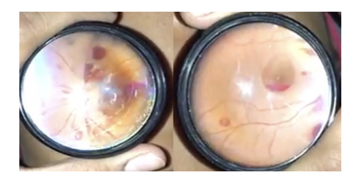
Fig. 1: Right eye fundus shows pre-retinal haemorrhage on macula. Roth's spots and arterial attenuation around macula

mildly diminished. Her erythrocyte sedimentation rate was raised to 32. Sickle solubility test was negative. Activated partial thromboplastin time was 40.70 which is slightly raised. Her fasting blood sugar[FBS] was 98 mg/dl, post prandial blood sugar after two hour [PP2BS]130mg/dl and HbA1c 5.6%. General examination showed severe pallor. There was coincidental finding of bilateral simple ovarian cyst on abdominal ultrasound approximate size of cyst is 2.3cm x 1.8cm. After admission we gave three packed cell volume [PCV], blood transfusion on the first day of admission and one PCV on next day. After four PCV's patients Hb was 9.20 gm% and platelet was 49000/ mm<sup>3</sup> after three days. Her systemic symptoms alleviated. Smear study showed only few abnormal RBC's and reduced platelets. Patient was lost to follow up. Two months after discharge she came for follow up and we learned that patient had restored her normal vision, and currently had no visual complaints.