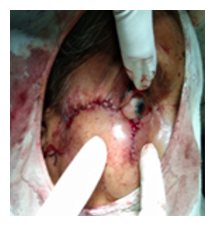
Fig. 2: Lid reconstruction was done by Tanzel flap technique

Follow up on 1<sup>st</sup>, 7<sup>th</sup>, 30<sup>th</sup> day and 6 month revealed no complication or recurrence. Biopsy revealed presence of large hyperchromatic neoplastic cells with vacuolated basophilic cytoplasm. The IHC report came positive for cytokeratin 7 and negative for cytokeratin20, CD10 and Vimentin. There is 3%-5% of KI67 positivity indicating its invasiveness. The final diagnosis came out to be sebaceous gland carcinoma of eyelid.