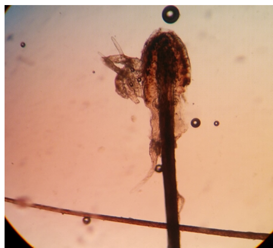
Fig. 3: Cluster of Demodex mites near the root of lash