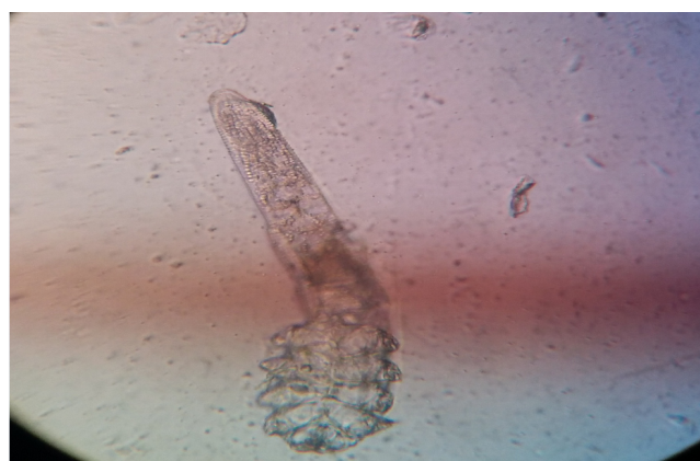
Fig. 5: Demodex mites away from lash