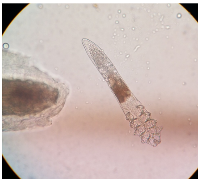
Fig. 2: Morphology of Demodex mite