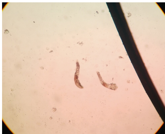
Fig. 4: Demodex mites near the shaft of lash