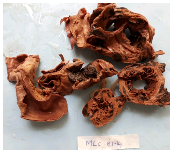
Fig. 2: Specimen of heart with malignant melanoma deposits in heart showing gray brown melanoma masses in between cardiac muscle