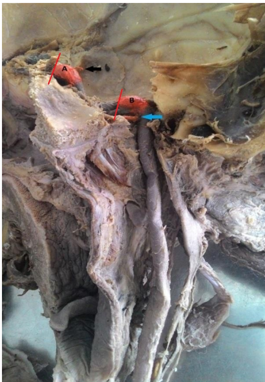
Fig. 2: Cavernous part of ICA between the two red lines blue arrow - artery of pterygoid canal, black arrow - meningo-hypophyseal trunk; A- terminal segment of cavernous part; B- terminal segment of petrous part

The above parameters showed no significant side differences.