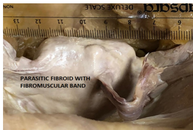
Fig. 2: Anterior view of uterus showing the fibromuscular band of parasitic fibroid

Greater omentum covers the abdominal viscera and is derived from visceral peritoneum. Anatomically both uterus