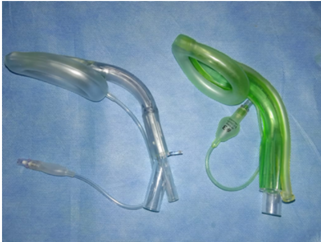
Fig. 1: LMA supreme™ and Ambu® AuraGain™

In the present study, out of the 140 patients considered, SADs were successfully inserted in 138 patients and in 2 patients airway was secured with endotracheal tube as SAD insertion exceeded maximum of 3 attempts. (Figure 2) Hence the statistical analysis was done for 138 patients. (Table 1)