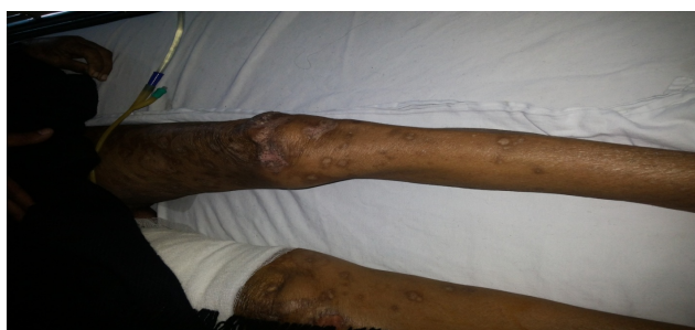
Fig. 3: 3