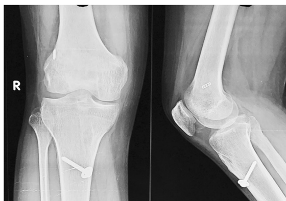
Figure 11: 12 week post op X ray shows no widening of tunnels.

tibia from a point located half way between the tibial tubercle and the posteromedial corner of the tibia and exiting into the joint at the previously identified site [Figure 8]. Fully extending the knee and ensuring that there was no impingement of the guide pin against the roof of the femoral notch further confirmed the position of the tibial guide pin. A cannulated reamer with the same diameter as the tibial end of the graft was used to drill the tibial tunnel.