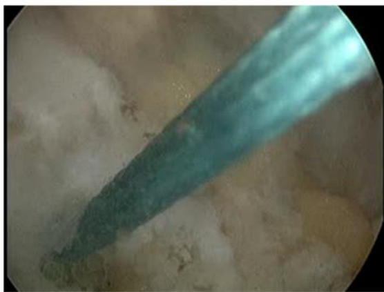
Figure 7: Suture loop passed through femoral tunnel.