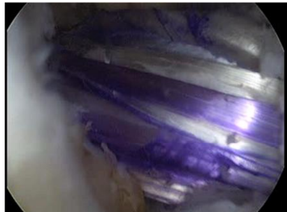
Figure 9: Graft pulled into femoral tunnel.