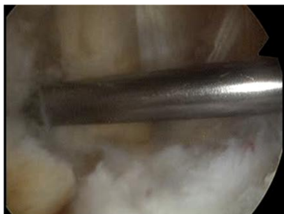
Figure 1: Femoral notch cleaned and femoral ACL footprint identified.

A standard anterolateral (AL) portal was placed for diagnostic arthroscopy. After confirming the diagnosis of ACL tear by arthroscopic examination of the knee joint, the ipsilateral hamstring tendons (both semitendinosus and gracilis tendons) were harvested using a closed tendon stripper through an oblique skin incision along the distal insertion of the tendons on the proximal tibia and prepared as a 4-strand double loop graft. While the graft was being prepared and sized by an assistant an anteromedial (AM) portal was established making sure that the instrument placed through the AM portal would be able to reach the posterior margin of lateral wall of the femoral notch without damaging the medial femoral condyle. Clearing of the notch was done to improve visualization of the native tibial and femoral footprints of ACL [Figure 1]. A radiofrequency ablator was used to clear the notch rather than a mechanical shaver so that bony landmarks could be preserved and care was taken to clear the lateral wall of the femoral notch right till the over the top position. Any associated meniscal and synovial pathology was addressed.