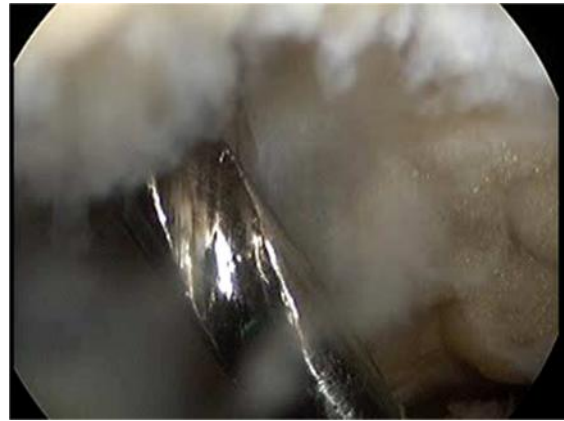
Figure 8: Tibial guide pin passed through tibial ACL footprint.