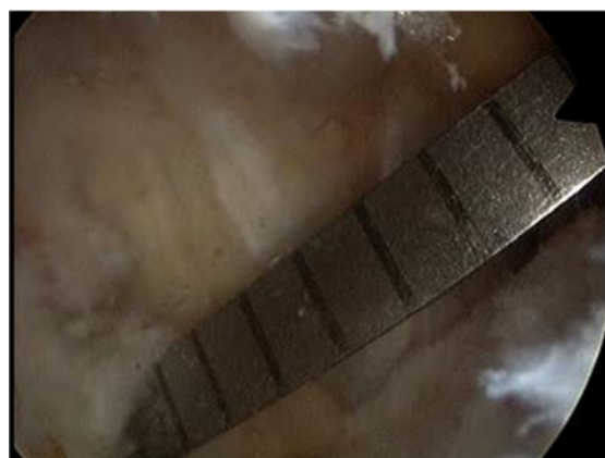
Figure 4: Femoral tunnel length measured.

Arthroscopic over the top offset guides, available with different offsets were routinely used. The offset guide aims to preserve a 2 mm posterior wall in the femoral tunnel. In a 10 mm diameter femoral tunnel (5 mm radius), an offset guide of 7 mm ( 5+2 = 7 mm) will be adequate to maintain 2 mm of the posterior wall. With the knee at 90° flexion, appropriate offset guide was introduced through the AM portal and after fixing it at the over the top position it was rotated so that it guides the pin into the lateral condyle at the level of the center of the femoral footprint previously marked [Figure 2]. Just the tip of the guide pin was drilled through the offset guide so that the entry point of the pin was marked. With the guide pin held in the same position, the knee was moved to 120° flexion and the guide pin is further drilled to exit out of the skin on the anterolateral aspect of the thigh. By using the intraarticular marking of center of femoral ACL footprint as guide for introducing the femoral guide pin, there was no case in which the pin is exited too posterior or too anterior with respect to the femoral shaft. A 5 mm cannulated drill bit was used to drill over the guide pin and exit out of the lateral femoral cortex [Figure 3]. The length of this