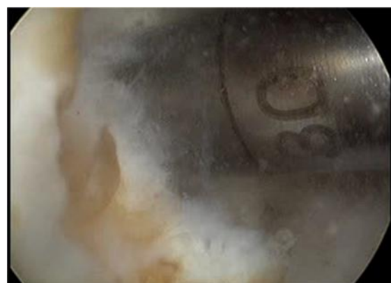
Figure 5,6: Femoral tunnel reamed through AM portal to desired length.