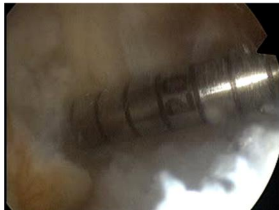
Figure 3: Cannulated drill over guide wire.

o'clock position (right knee)/2-o'clock position (left knee), corresponding to center of the femoral ACL footprint within the knee. [8]