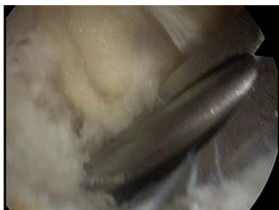
Figure 2: Drill site for femoral tunnel approached through an offset guide placed through AM portal.

Under direct arthroscopic visualization at 90° flexion, the center of the femoral footprint was located and marked with a microfracture awl at 10-