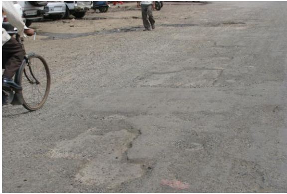
Figure 1: Loss of Aggregates during rainy season

Because of loss of aggregates during rainy season the portions from which the aggregates are lost have been filled with water and this causes the main reason for deterioration of road. The water pressure causes the soil and aggregates to move from its place. Passage of traffic again put the water with high pressure inside the pavements and soil particles enter the pavements. Thus the width of pothole goes on increasing. Low content of bitumen causes the accumulation of aggregates on road sides.