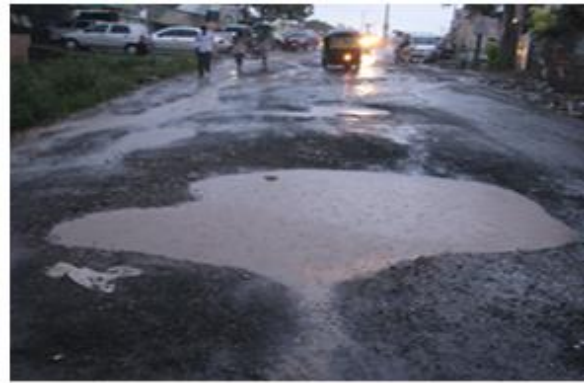
Figure 3: Formation of potholes on road due to poor drainage of road surface

During rain some amount of water flows away from road surface due to camber provided to it while maximum amount of water is getting accumulated on road surface which further gets percolated through the road surface to the inner layers. This inner water layer can adversely affect the inner portion of road like loosening of aggregates, loss of bond between the aggregates etc which further causes the deterioration of the inner layer results in formation of huge potholes on road surface as shown in figure 3 below.