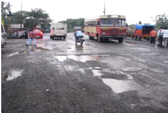
Figure 2: Accumulation of Aggregates on Road Sides

This is called as failure due to poor drainage of the roads. The failure pattern is as shown in figure 2 below