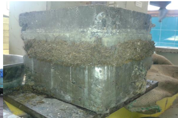
Figure 4: Model showing rice husk layer as sub base

As it was discussed earlier every year approximately 600 million tons of paddy (after- M. Ahiduzzaman, Rice husk Technologies In Bangladesh) are produced globally. The research is being done for usage of this rice husk as one of ingredient of road layers. The sub base layer of road can be prepared by using rice husk. The model view of same is represented in figure 4 below.