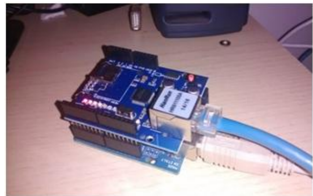
Fig. 1 Class-0 IoT Device (Arduino-uno) with Ethernet Gateway