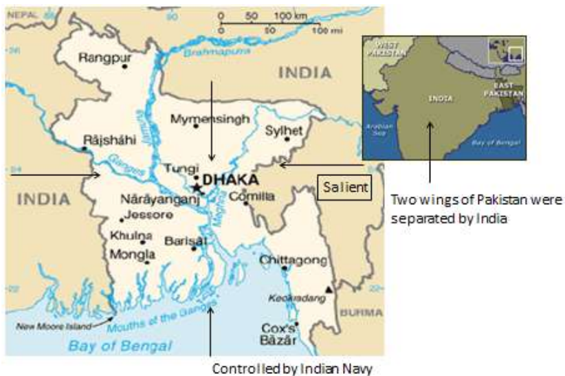
Figure 3: Salient feature of Bangladesh's geography

launched a large scale military invasion to capture Dhaka, the capital of East Pakistan, from all four sides (Figure 3). The Eastern Commander of Pakistan developed 'fortress concept' to defend East Pakistan's lands from the Indian seizing. Following this strategy, Pakistan army had converted important border towns as the center of conventional war, particularly those falling on the main axis of enemy advance (Salik, 1997, pp. 124-25). The logic of the adoption of this policy was that these 'fortresses' would make a great hindrance to the Indian advance towards Dhaka (Niazi, 1998). But New Delhi did not act according to Pakistani military planners; rather, according to Lt Gen Jack Jacob (Chief of Staff of India's Eastern Army), Indian army avoided Pakistani fortresses by using bypass route (Jacob, 1997).