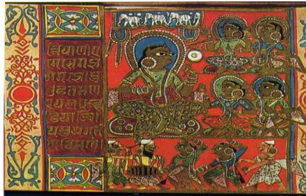
Figure 3: Trishala enjoying the dance performance.

In the early modern period, a profile is the most prevalent mode of representing the face in painting. Basically, the Early Rajput style, previously called the Chaurapancasika style, represents the figural face in complete profile in around the 16 th century (figure 4). Likewise, the manner is identical to Rajput painting in Hindu native states. In contrast, Mughal painting that maintains the Persian influence in the initial stage applies a three quarter face to the profane people. In the 17 th century, Mughal painting accepts a profile as a standard mode of the face (figure 5), which transition seems to be similar with that from the Jain style to the Early Rajput/Chaurapancasika style.