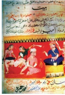
Figure 7: Hamzanama

However, the divine face maintains the traditional front view in the early modern miniatures in comparison with the profane people with a profile, partly because of its suitability to worship. As a result, the painters used a three quarter face in between the frontal and side views to the religious authorities, or siddha and divine entities such as goddess (figure 8) and Siva. It is assumed that a three quarter face enables us to percept the figure as being more consecrated than a profile, which is less consecrated than a frontal view.