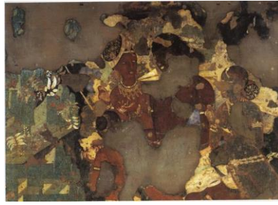
Figure 2: The heavenly beings

In the early modern period, a profile is the most prevalent mode of representing the face in painting. Basically, the Early Rajput style, previously called the Chaurapancasika style, represents the figural face in complete profile in around the 16 th century (figure 4). Likewise, the manner is identical to Rajput painting in Hindu native states. In contrast, Mughal painting that maintains the Persian influence in the initial stage applies a three quarter face to the profane people. In the 17 th century, Mughal painting accepts a profile as a standard mode of the face (figure 5), which transition seems to be similar with that from the Jain style to the Early Rajput/Chaurapancasika style.