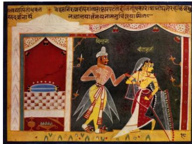
Figure 4: Birhana and Chanpavati in the room