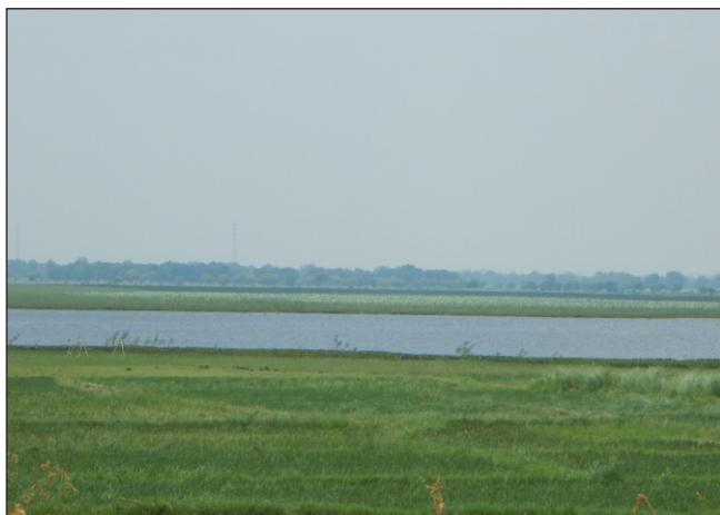
Fig. 1: A view of Alwara Lake in Kaushambi district (U.P.).

recorded this water bird in maximum number during first week of June as they remain confined around the wetlands in search of water. Besides actual sightings, inquiries from local people were also made to ensure the estimate of existing population and their perceptions about the existence of the crane. All the observations were made while moving through the chappu boat and walking along the croplands, mud lands, natural areas using binoculars (7x35 and 8x40-BEZIF BM-9) and canon cameras.