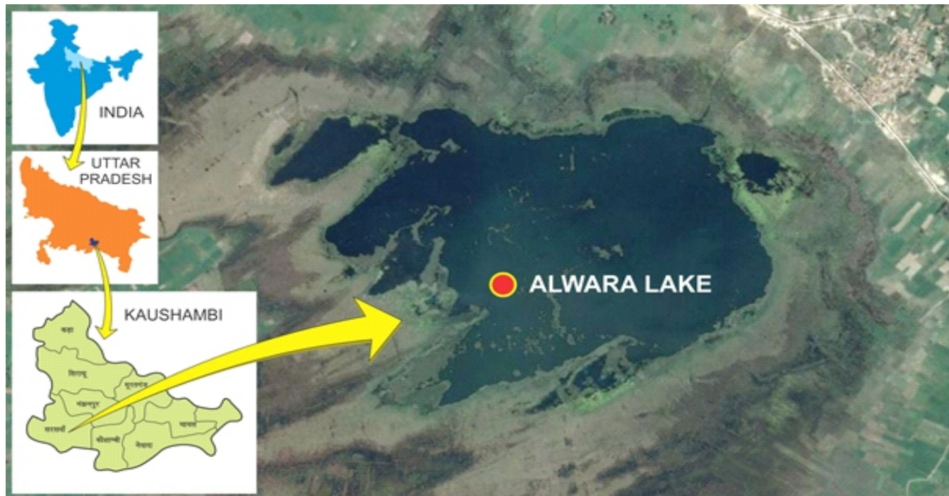
Map 1: Study Area in Kaushambi district (U.P.)

meter. It is surrounded by agricultural fields and is connected to the river Yamuna and Kishanpur lift canal and covers more than 1750 hectares. It is located in Sarsawan block of Manjhanpur tahsil of district Kaushambi of Uttar Pradesh. The lake is skirted by villages like; Ranipur, Dundi, Hatwa and Bhawansuri in the east, Paur Kashi Rampur, Alwara and Gaura in the north, Shahpur, Umrawan in the south and Mawai, Tikra and Dalelaganj in the west.