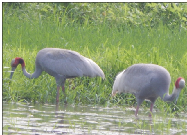
Fig. 2: Sarus Crane pair in paddy field near Alwara Lake.