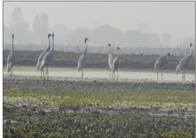
Fig. 4 : A congregation of Sarus Crane in Alwara Lake.

During study in and around Alwara Lake, authors noted that the presence of abundant paddy fields, land under irrigation, vegetation at the edge of the crop fields, type of crops grown, marshy wetland and the openness of habitat are the major factors for the existence and survival of sarus crane. Moreover, decrease in pollution level and reduction in harmful anthropogenic activities is other significant factors.