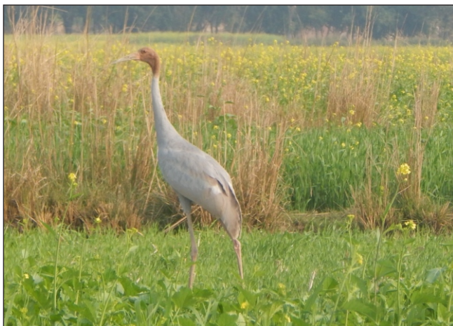
Fig. 3: Juvenile of Sarus Crane in study area.

The authors visited the villages concerned a number of times at least two days per month, contacted the people and told as well as convinced them not to kill or hunt the sarus cranes, their eggs and juveniles. The authors organized awareness programs regularly with group of local people and continued it even when 1 or 2 villagers were there. They were detailed about legal aspect, protection, conservation and maintenance of its natural habitat. (Prakash et al. , 2016c).