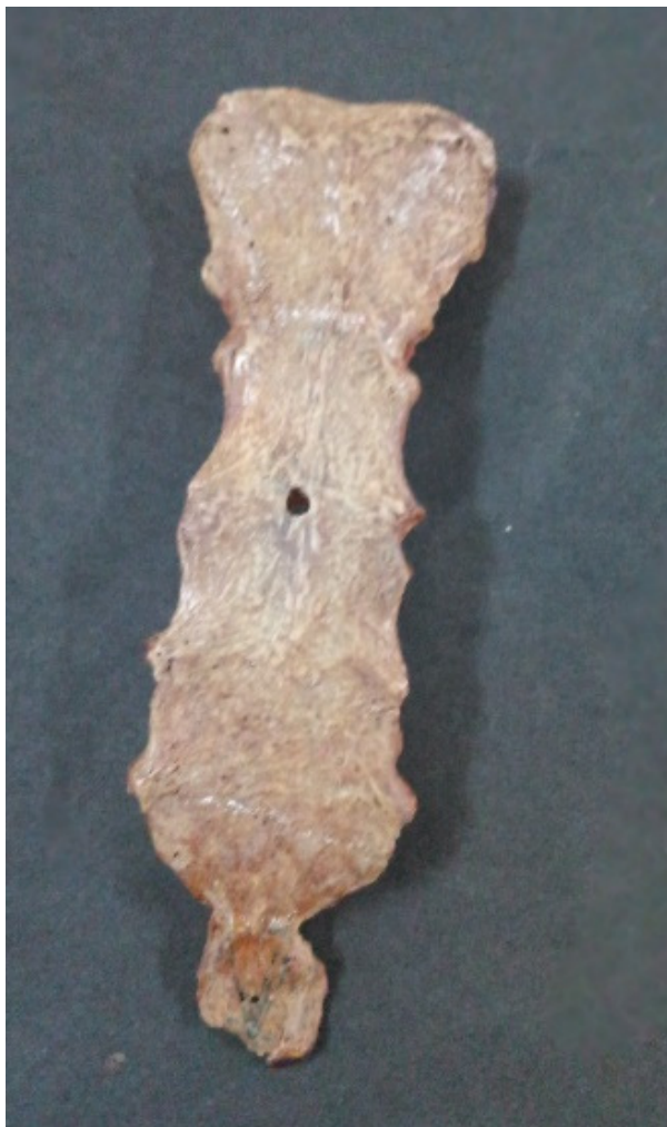
Fig. 1. Single sternal foramen over the body

Out of 10 sterna having sternal foramen, the foramen was present over the manubrium in 2 bones (2%), over the body in 4 bones (4%), over the xiphoid process in 3 bones (3%) and at the xiphisternal articulation in one bone (1%). Double foramen was present in two sterna over manubrium (Fig. 1-3).