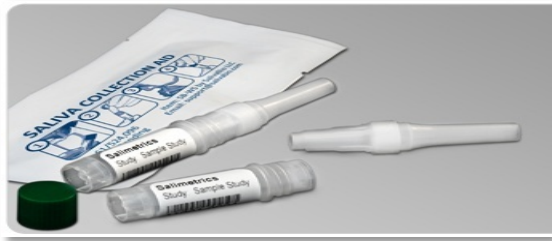
Figure 2: Passive drool

Storage: These can be stored at -80degree Celsius for several years. On the day samples are to be screened, bring samples to room temperature, vortex, and then centrifuge at 1500 x g for 15 minutes. If the samples appear viscous, centrifuge for a greater amount of time, or break up the clot with a pipette tip and re-centrifuge. Screening should be performed using only clear saliva. [4]