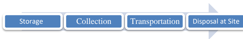
Figure 3 Waste management of Kokrajhar town

market. it is very obvious the possibility of contaminant reaching from the open dumping, ground water contamination and emissions of anthropogenic greenhouse gas. The unscientific disposal of msw causes an adverse impact on the vital components of environment along with human health [14] Waste management of Kokrajhar town is shown in Fig (3).