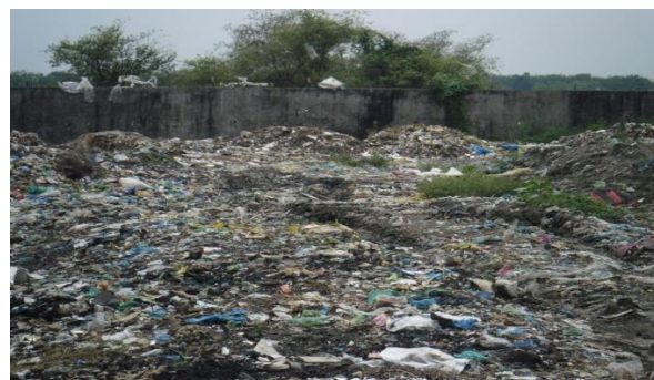
Figure 2 Disposal site of Kokrajhar town

Since the disposal site lies near the Gaurang River, covering an area of about 800 sq.mtr. This area is commonly known as samshanghat which is about 1.5km away from Kokrajhar daily