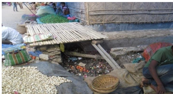
Figure 1 Throwing of waste into drain

From survey it was observed in the market area Majority of sellers are seen collecting the wastes in a particular and wait for the sweepers to come and few of them have private collection system and emptying them in public dumping areas. The very familiar picture seen is that sellers generally collect their garbage and keep them in front of their shops and then they simply burn it or Simply throw their solid wastes in the drains adjoining the roads(fig 1) which leads to the blockage of those drains due to which various severe problems occurs such as artificial flood during rainy days, spreading of disease like malaria etc. For the convenience of collection, the whole area has been divided into numbers of zone and for each of the zone private contractors were given the charge for maintaining cleanliness in their particular areas by the municipality board of Kokrajhar town. They are given the charge for proper collection and disposal of garbage in their own areas on daily basis and thus contractors have appointed their own sweepers for carrying out the proper collection and disposal of garbage in their respective areas. From the field visit it was observed open dumping (fig 2) is the practice of disposal of MSW of Kokrajhar town which is considered unscientific approach.