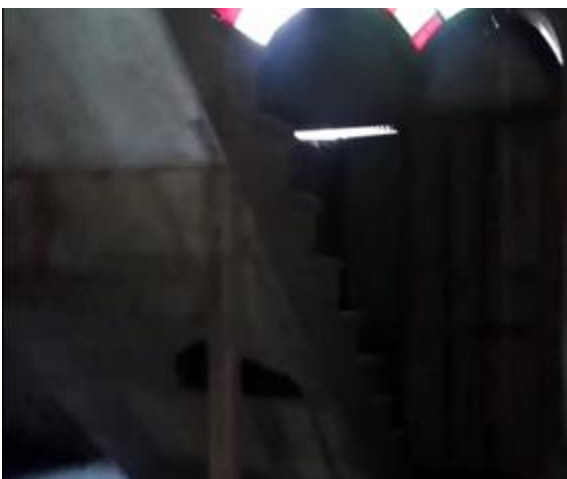
Figure 5 c) Damage in Stair At Palace