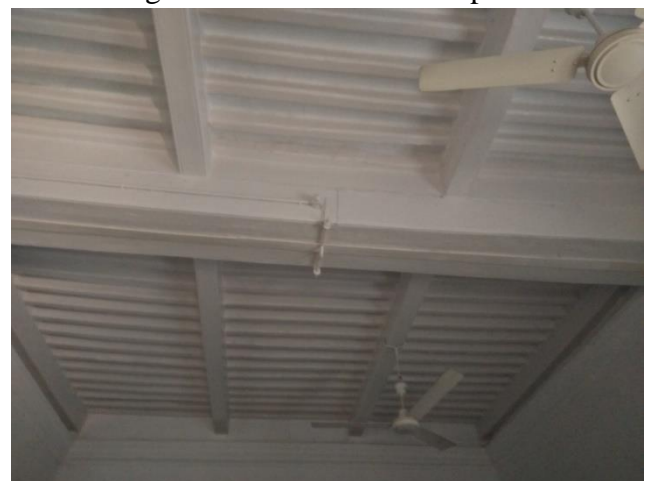
Figure 1 b) Repaired roof At Kothi Ghar