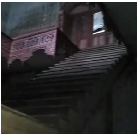
Figure 5 a) Stair case at Raghunath Palace