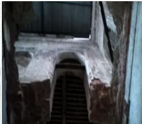
Figure 3 a) Damages to External walls