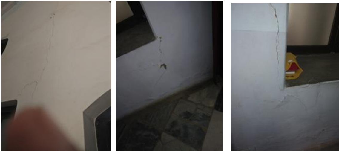
Figure 4 a) Hair line Crack Figure 4 b) Crack due to Settlement Figure 4 c) Structural Crack