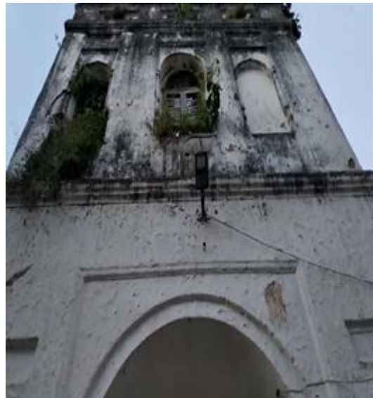
Figure 6 a) Plant growth at the edges of roofs and parapet Figure 6 a) Plants and algae attack