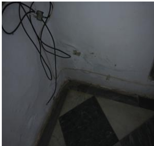
Figure 2 Soil consolidation leads to Settlement