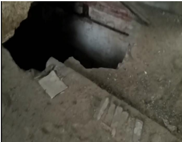
Figure 1 a) Roof damage at palace