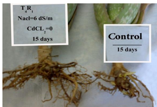
Fig 1. Effect of salt stress on root length

the growth decreased in other salinity rates and increased 6 and 12 dS/m in 45 days and then decreased when salinity increased. The gel weight increased 6 and 12 dS/m in 45 days and decreased when salinity increased but decreased in 45 days by salinity process (Table 3).