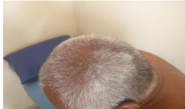
Fig-2: After Treatment status

Patient had irregular dietary habits of excessive use of curds, pickles, non-vegetarian foods and tea. He also had a habit of doing divaswapna every day after his lunch. This might have been the causative factor for developing Kitibha Kusta . The main complaints of the patient were whitish brown scaly lesions all over the body including scalp associated with itching and powdery discharge. After examining the patient depending on the Nidana and Lakshanas the treatment was planned i.e. Virechana karma followed by Shamanaushadis along with Nidana Parivarjana .