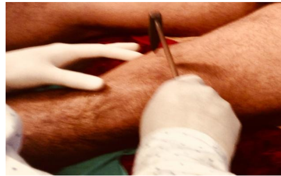
Fig-2: Agnikarma at Knee joint