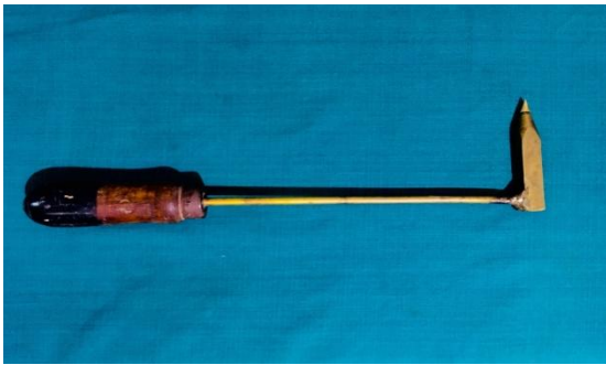
Fig-1: Suvarna (Gold) Shalaka